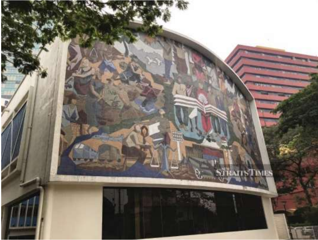
Dewan Bahasa dan Pustaka.