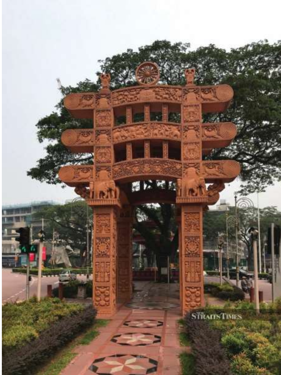
Torana Gate at Brickfields.