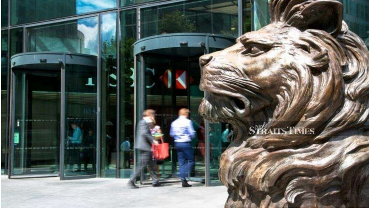
Lion sculpture at HSBC Bank Leboh Ampang.