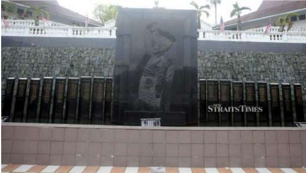
Tunku Abdul Rahman Putra Memorial.