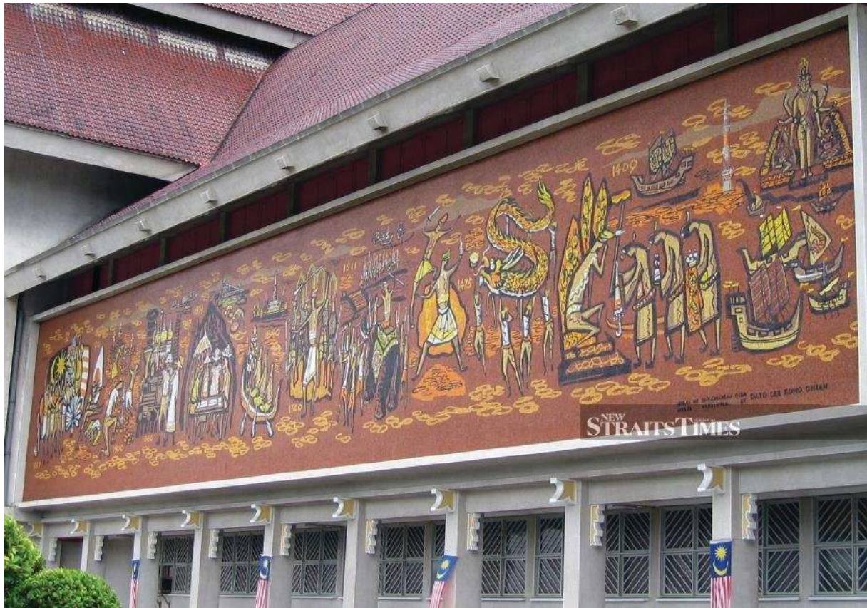
National Museum.