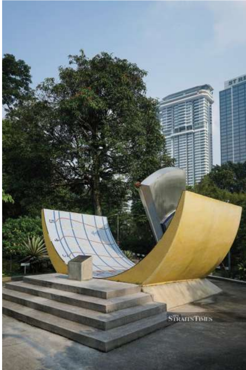
Merdeka Sun Clock at the National Planetarium.