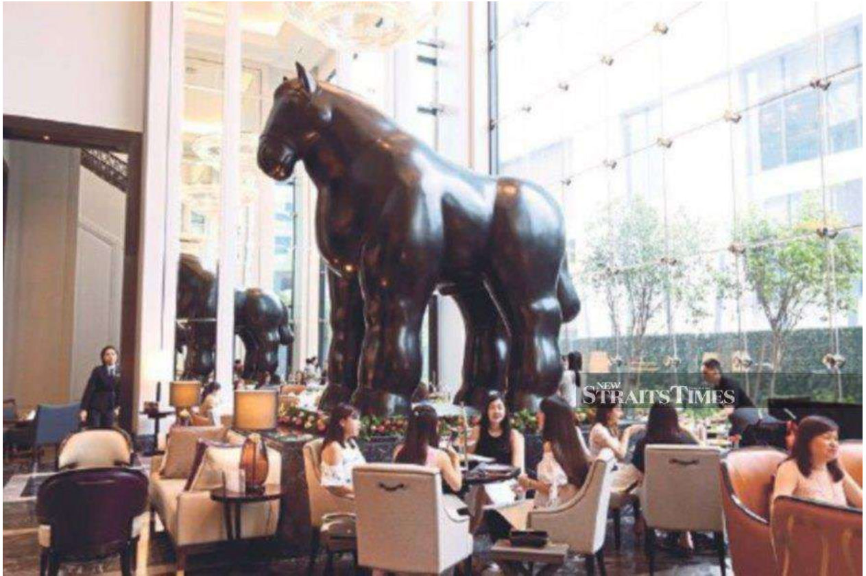
The Horse sculpture at St Regis Kuala Lumpur.