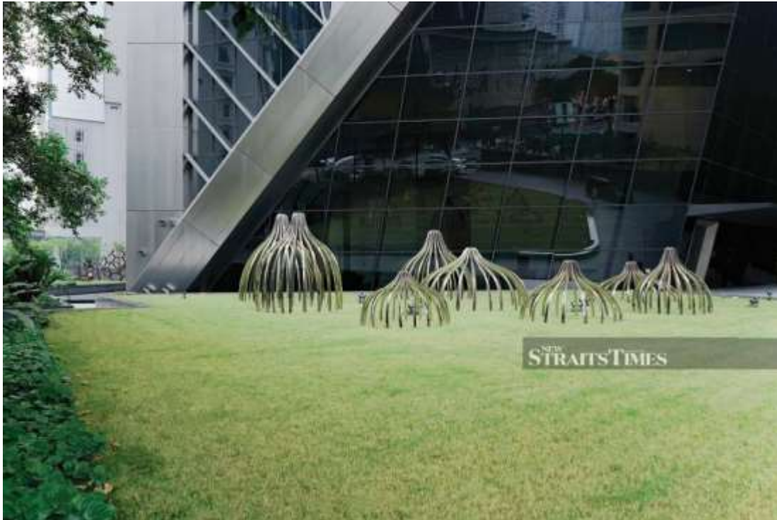
Breast Stupa Topiary at Ilham Tower.