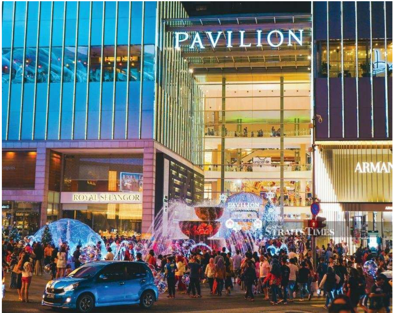
Pavilion Crystal Fountain.