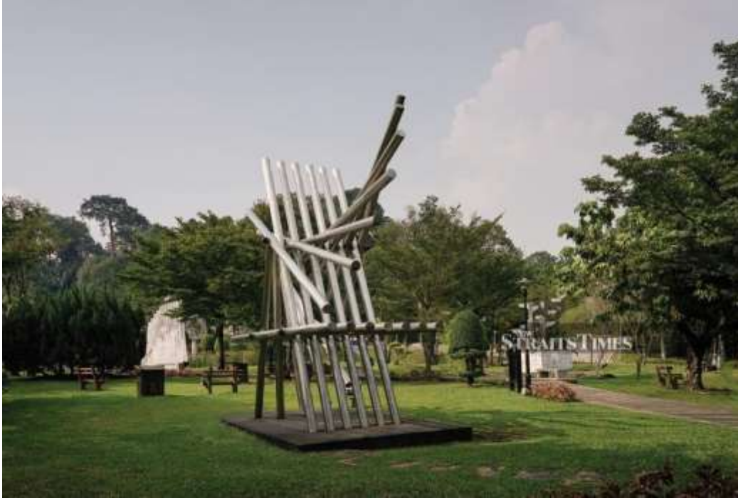
ASEAN Sculpture Garden with sculpture by Itthi Khongkhakul.