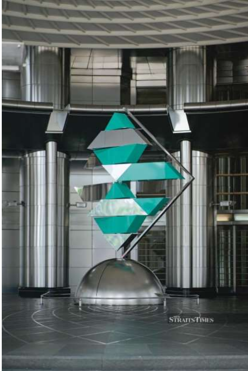
Kinetik II at Petronas Twin Towers.