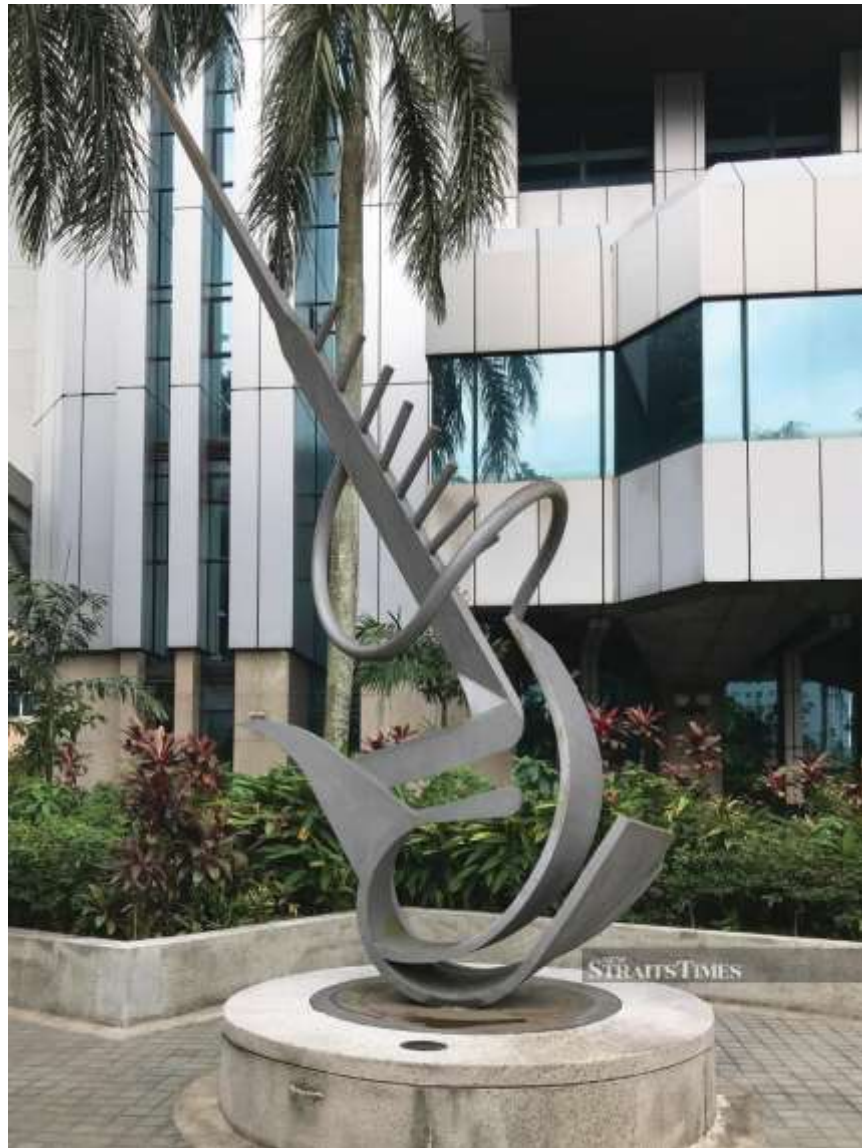
Vision 2020 - Nine Challenges at Taman Wawasan.