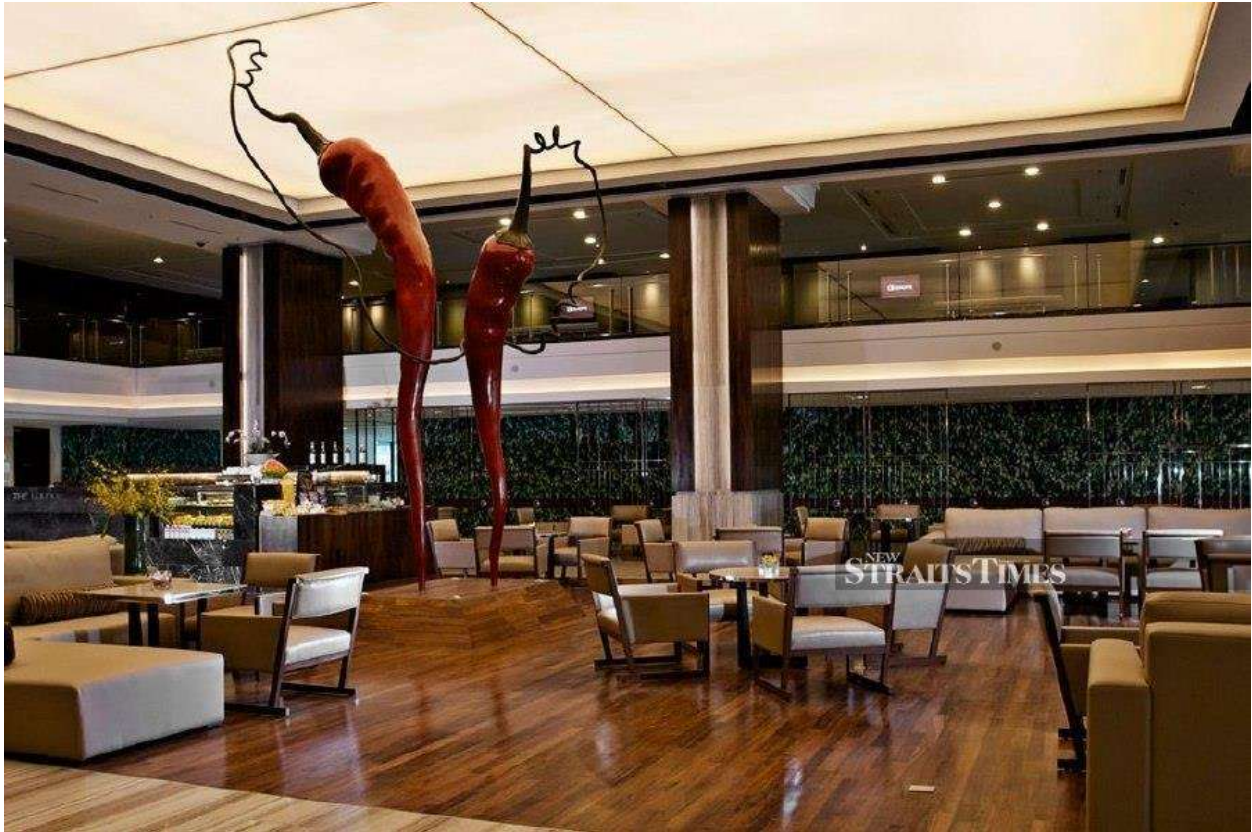
Wild Chili Couple at GTower.