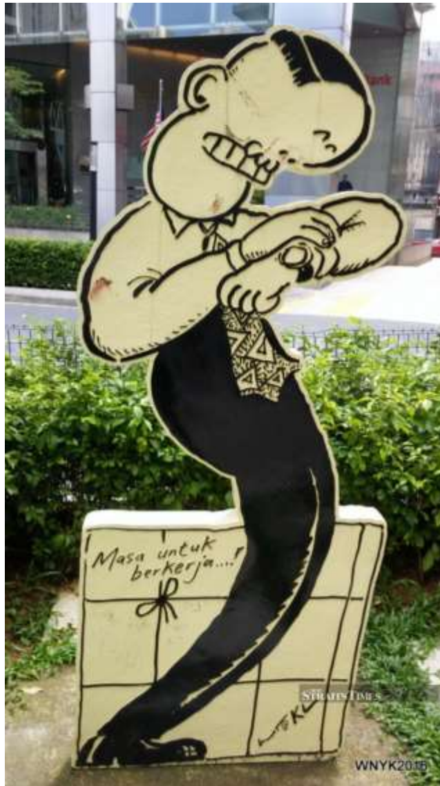
Lat Cartoon Series at Masjid Jamek.