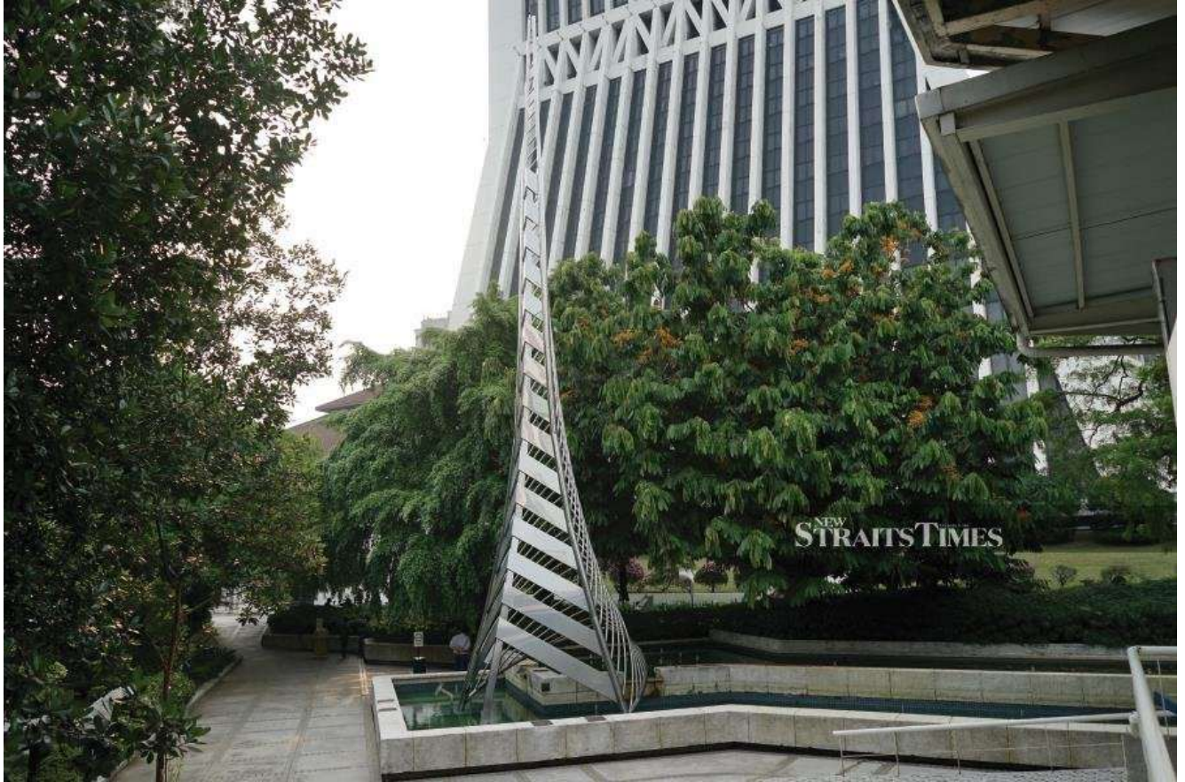
Keris at Menara Maybank.