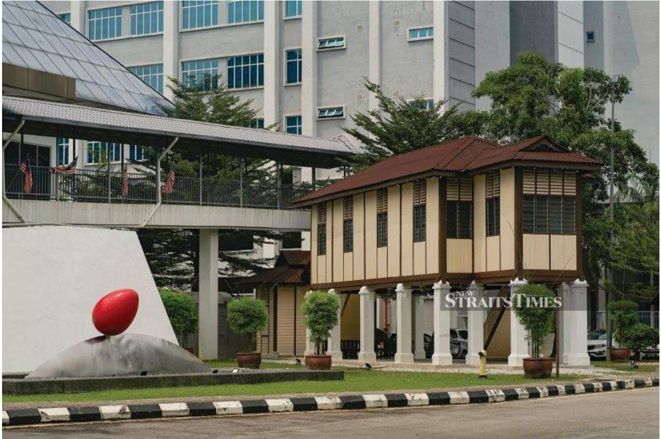
Egg Sculpture and Chow Kit Heritage House at National Art Gallery.